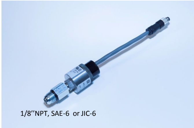
1/8" NPT, SAE-6 or JIC-6