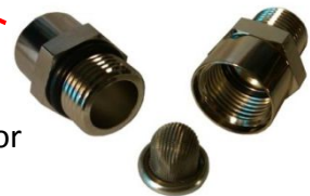
Visual clogging indicator