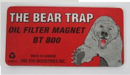
Magnetic pad is added on the filter housing to capture submicron ferrous contaminants