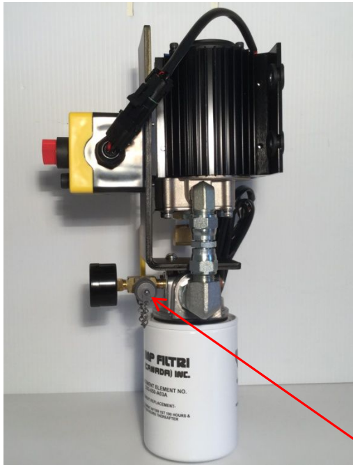
Mounting pad with anti-vibration grommets